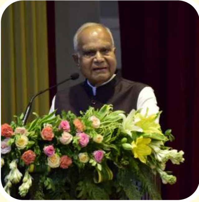
श्री बनवारीलाल पुरोहित जी माननीय राज्यपाल , पंजाब