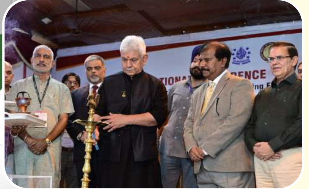
श्री मनोज सिन्हा माननीय उप-राज्यपाल, जम्मू & कश्मीर