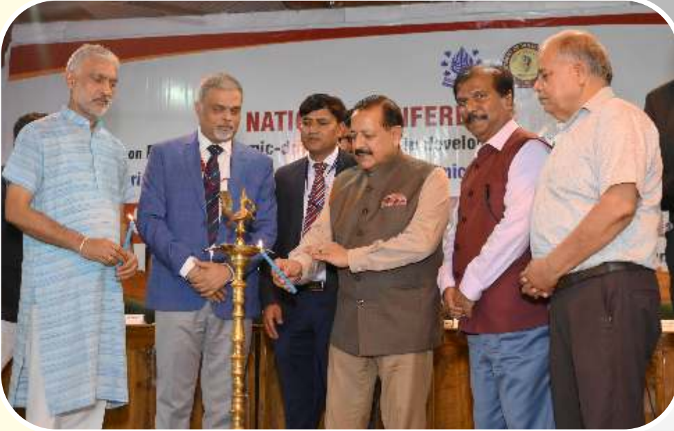
डॉ जितेन्द्र सिंह माननीय केंद्रीय मंत्री, भारत सरकार