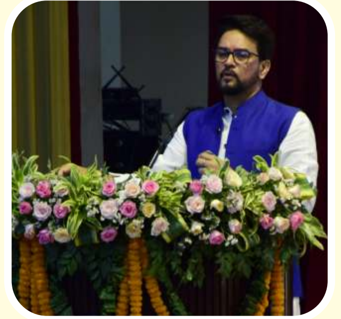
श्री अनुराग ठाकुर जी केन्द्रीय केबिनेट मंत्री, भारत सरकार