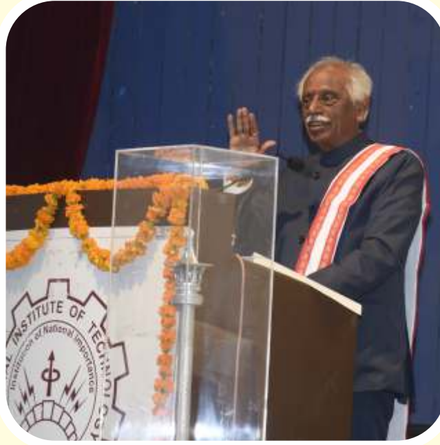
श्री बंडारू दत्तात्रेय जी माननीय राज्यपाल , हरियाणा